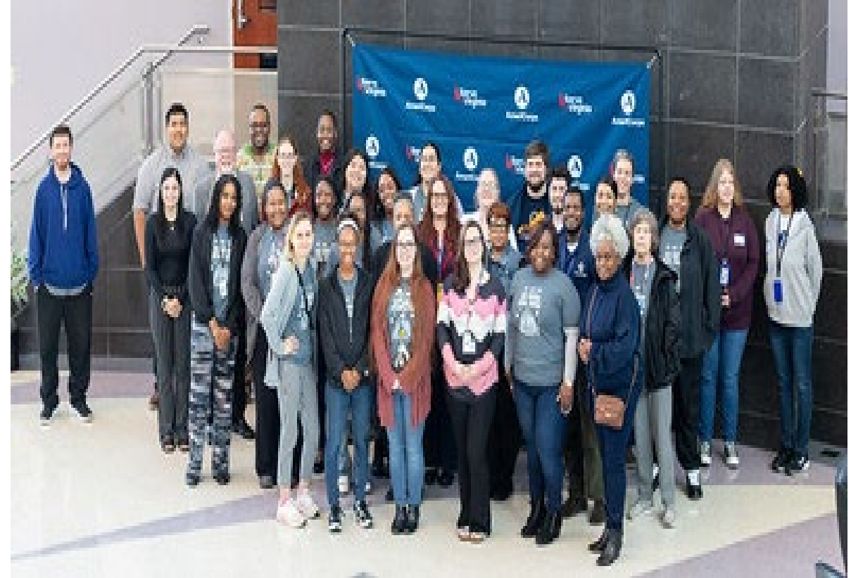
2026 AmeriCorps Members