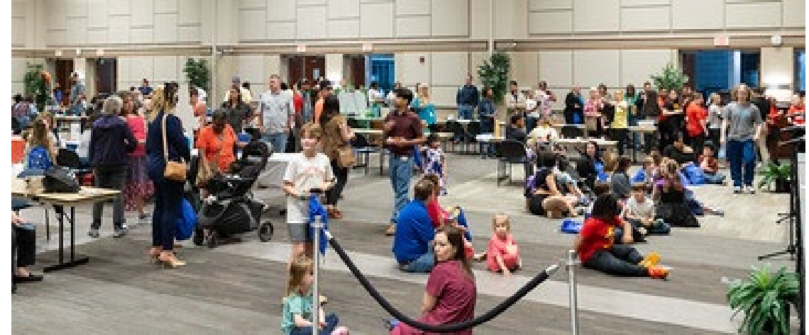
4 th Annual Family Literacy Night