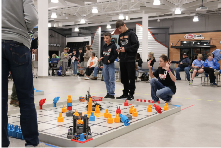
GO TEC Mini Competitions