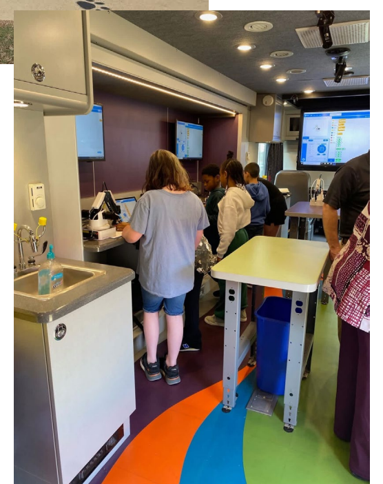
GO TEC Mobile Lab Engagements