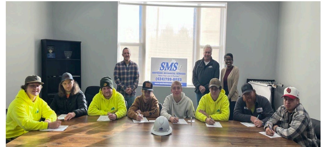
Southside Mechanical Services registered 9 apprentices