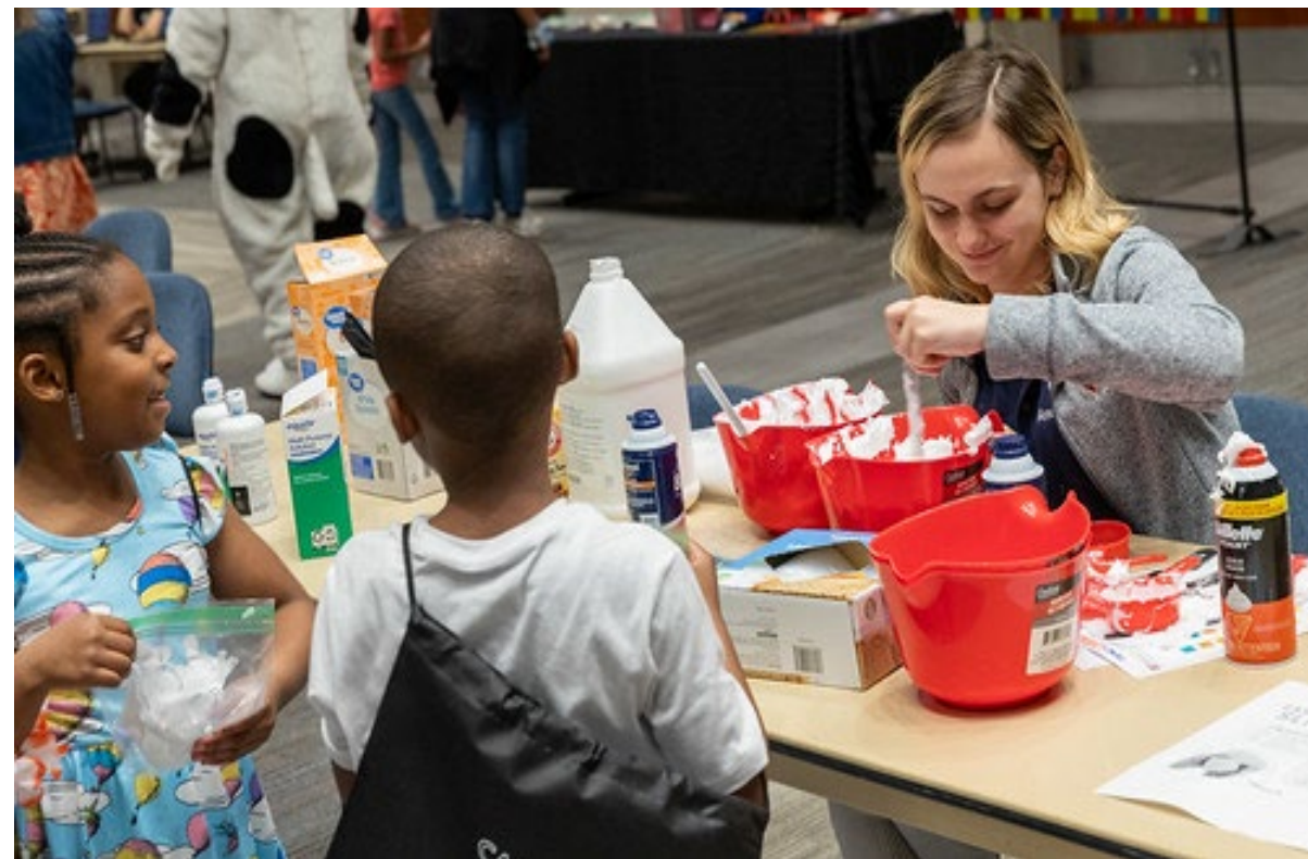
ABOVE: Family Literacy Night