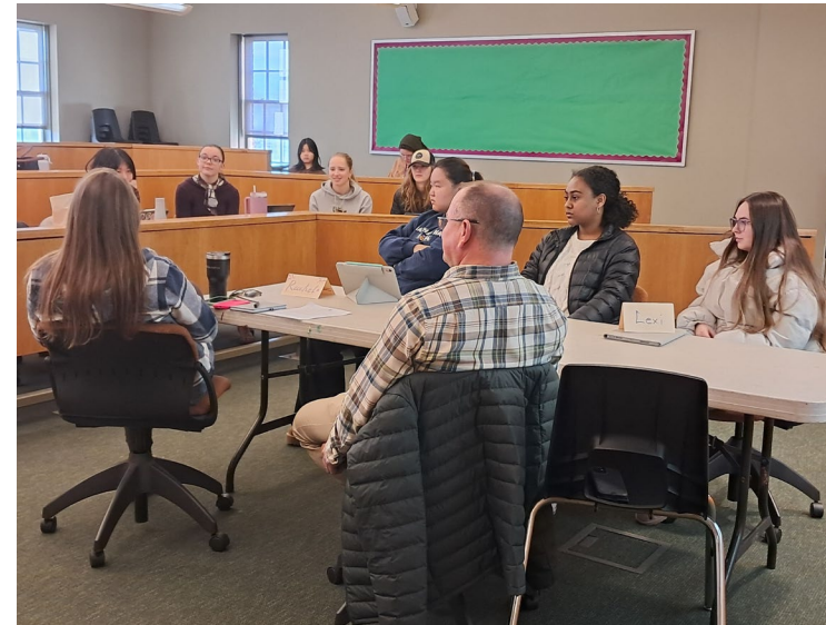
Chatham Hall Teamship Cycle